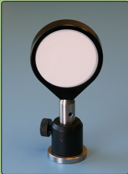
THz Low Pass Filter Visible To Mid IR Transmission Spectrum

It is an excellent filter for optical THz generation systems such as time domain THz spectroscopy systems. It has optimal characteristics for use in zinc telluride based systems and for typical photo conductive switch systems as well. As can be seen in the figure below, the measured transmission in the 700 to 850 nm range is below .01%. At wavelengths longer than 975 nm the transmission is below .1%. These measurements were done with a laser beam spectrally filtered to the wavelength of interest from a super-continuum white light coherent source.